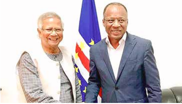
With the Prime Minister of Cape Verde HE Jose Ulisses Correia e Silva