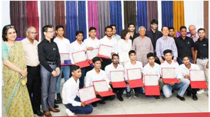
Nobel Laureate Professor Muhammad Yunus, staff, and board members of Japan Auto-mechanic School (JAS) with the third graduating class.