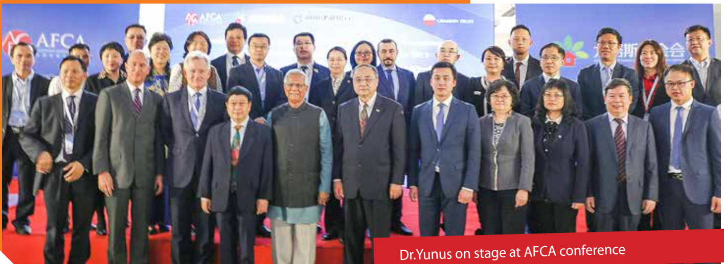
Dr. Yunus on stage at AFCA conference