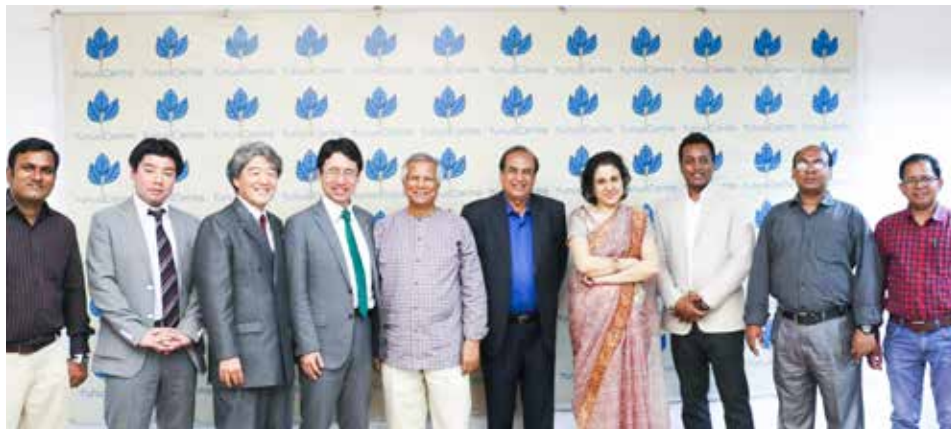
Grameen Euglena team during the board meeting with Professor Yunus