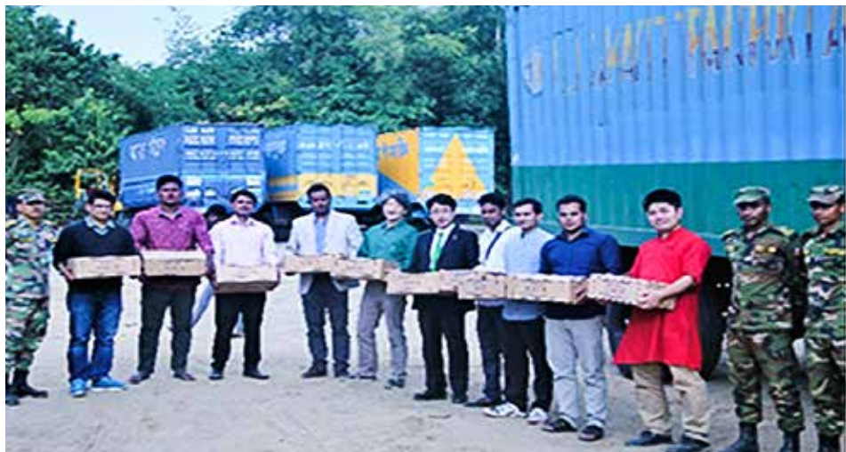
Grameen Euglena team during the distribution of biscuits for the Rohingya People

GE expanded the cultivation area and started exporting mung beans to Japan in 2012. In 2015, GE purchased 1,500 Metric Tons of mung beans from 3,184 contract farmers and exported 730 Metric Tons to Japan. It contributed a total of USD 0.15 million in income for farmers and Bangladesh earned USD 1.2 million as foreign money. In 2016, GE collaborated with the UN International Fund for Agricultural Development, a domestic development organization called PKSF, local NGOs, and a growing number of contract farmers. In 2017, it expanded to 5,000 contract farmers and covered over 2,400 hectares of cultivation area.