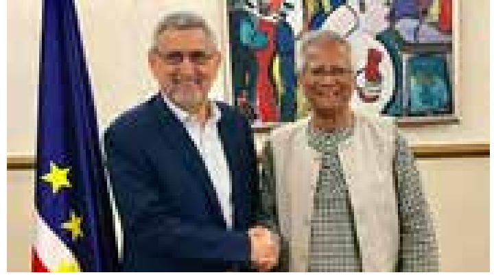
With HE President of Cape Verde Jorge Carlos Fonseca II