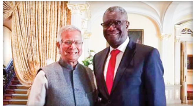
Professor Yunus with Nobel laureate Dr. Denis Mukwege