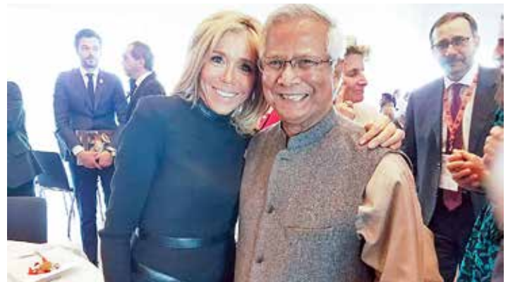
With First Lady of France Brigitte Macron.