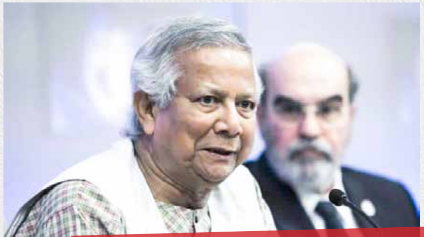
Professor Muhammad Yunus with Director General of FAO, José Graziano da Silva

FAO is also one of the founding members of the Global Network Against Food Crises that prepares the Global Food Crises Report, and that works to coordinate actions to address and prevent humanitarian crises, such as conflict. FAO, with the World Food Program, also reports periodically to the UN Security Council on the food security situation