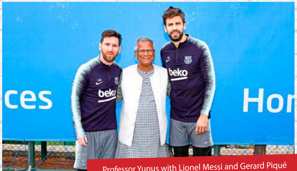
Professor Yunus with Lionel Messi and Gerard Piqué

-Professor Muhammad Yunus Founder Yunus Sports Hub