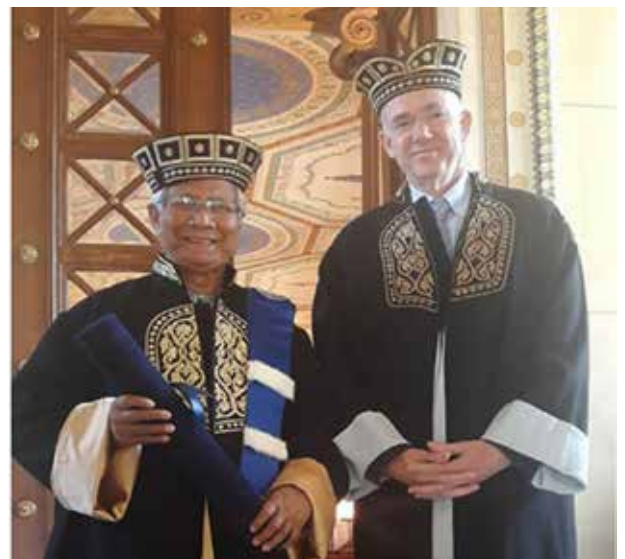
Nobel Laureate Professor Muhammad Yunus is made the Honorary Doctor of the Faculty of Economics and Political Science of the National and Kapodistrian University of Athens