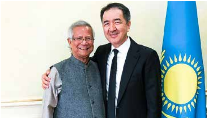
The office of Mr. Bakhytzhyan Sagintayev, Head of Presidential Affairs and immediate past Prime Minister of Kazakhstan.