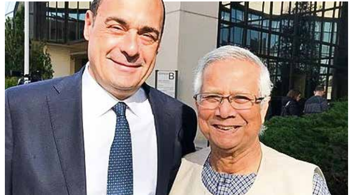
With Nicola Zingaretti, the Opposition Leader of the Italian Parliament and the General of the Democratic Party of Italy.