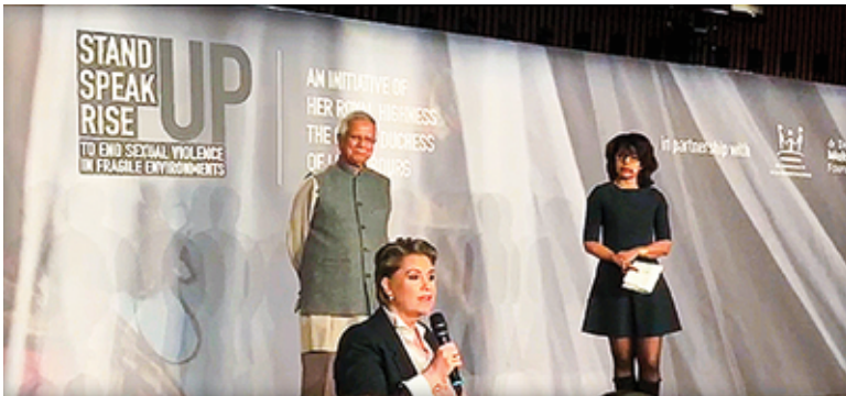
Professor Muhammad Yunus with the Grand Duchess of Luxembourg

Nobel Laureate Professor Muhammad Yunus attended “Girls Night,” a session at the Gala, where he appeared on stage with the Grand Duchess in order to honor all victims of sexual violence. He delivered a heartfelt speech on the current asymmetric relationship between men and women and the importance of the removal of restrictions on women in patriarchal societies.