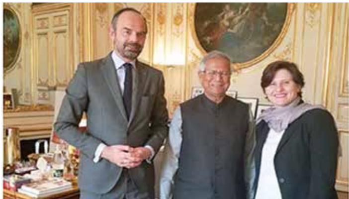
With the French Prime Minister, Edouard Philippe and the Sports Minister, Roxana Maracineanu.