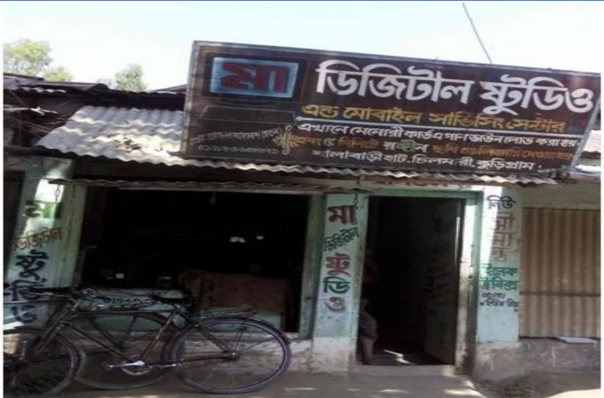
Proposed NU Business Name : Maa Digital Studio & Mobile servicing Center